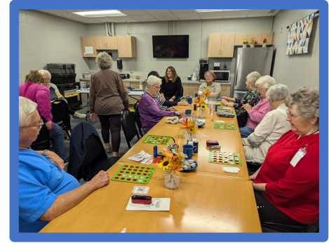
↑ Falls Prevention Bingo at the Perham Area Community Center