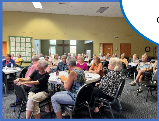
Scam & Fraud presentation at First Lutheran Church of Battle Lake

Dancing Sky's Resource Specialists answered 11,915 calls statewide in 2024