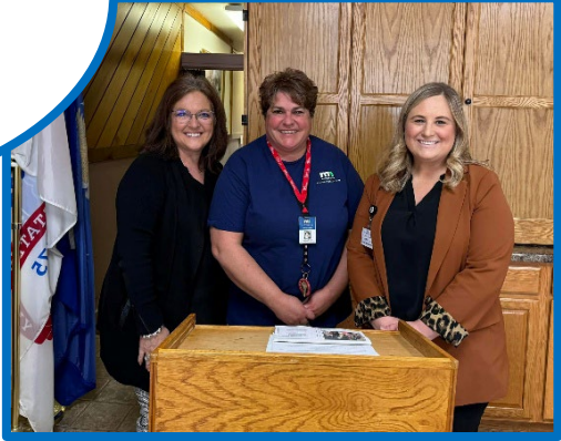
Medicare presentation at Benedictine Living Community in Crookston