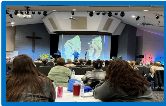
← Park Rapids Teepa Snow dementia education event - 252 attendees